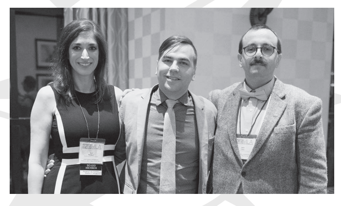
What If? Alternative Histories and Reimagined Worlds This panel explores the relationship between history and space, examining fictional histories and the impact of alternative

What Counts As a War Story? Papers should address one aspect of war literature that doesn't necessarily fit into the paradigm of the traditional combat narrative. The focus might be on soldiers in non-combat roles or serving during peacetime, the changing role of women in war literature, or the blurred lines between civilians and soldiers during war.